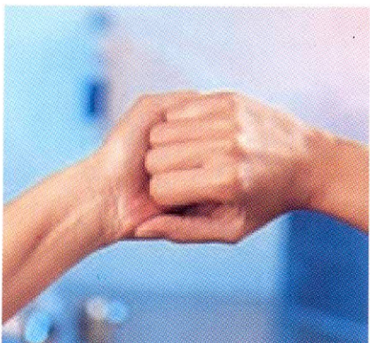
4 th step: Back of fingers to opposing palms with fingers interlocked.