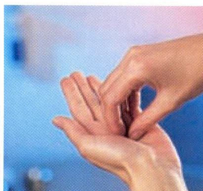
6 th step: Rotational rubbing, backwards and forwards with clasped fingers of right hand in left palm and vice versa.