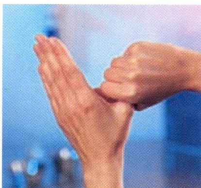
5 th step: Rotational rubbing of right thumb clasped in left palm and vice versa.